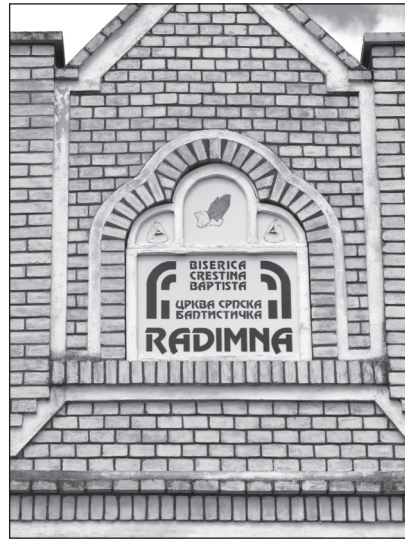
Serbian Baptist Church Radimna, Romania

emphasize their ethnic affiliation, as may be seen from the inscription on the church building in Radimna: The Serbian Baptist Church. An adverse attitude of the majority of Orthodox Serbs, although much less pronounced than it was in the past, at the time when the first Baptist communities were founded, may be observed in the use of the negatively connotated Romanian word pocaiti (“penitents”) to refer to those who converted to the Baptist faith. However, mutual respect and dialogue between Orthodox Serbs and Baptists with regard to local community issues is growing. Religious pluralism poses a great challenge, both for societies and governments on the one hand, and for religious communities on the other. The diaspora issue and diaspora studies are directly related to the issues of ethnic identity, while religious affiliation certainly plays an important role in building the identity of diaspora communities. The intertwining of religious and ethnic identities raises numerous questions, and studies of diaspora communities and of their modes of adaptation may provide valuable insights into general patterns of religious change.